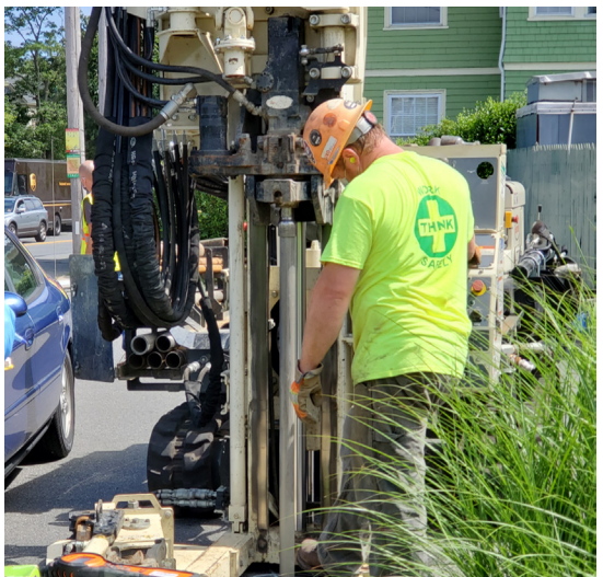
Geoprobe for soil and groundwater sampling

Also check the company's insurance coverage. You or someone whose experience you trust should review the policy in detail. This is critical because the consultant could overlook something, worsen the existing contamination, cause new contamination, or damage a third party's property. If the consultant lacks coverage for these types of incidents, you may be liable.