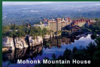
Mohonk Mountain House

NYS Department of Environmental Conservation