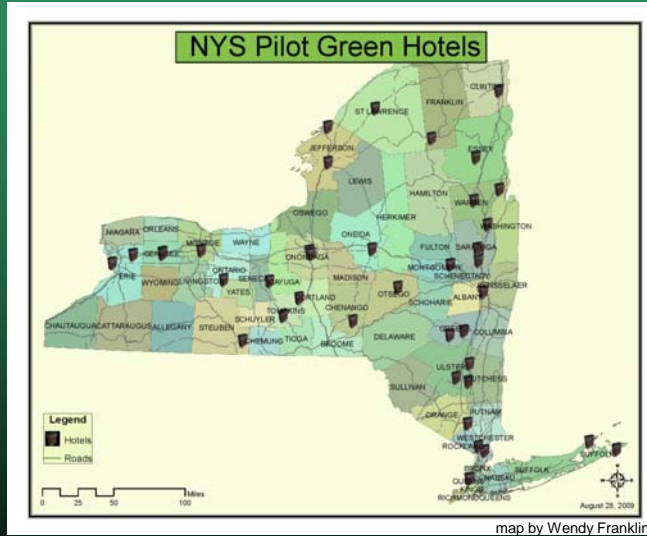
map by Wendy Franklin

NYS Department of Environmental Conservation