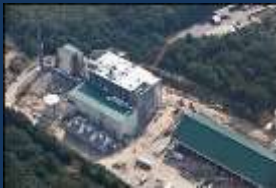
Plainfield Renewable Energy biomass power plant On former Gallup's Quarry Superfund Site, Plainfield