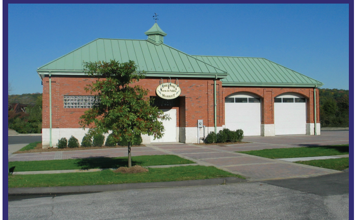
Shelton Farmers Market – before and after