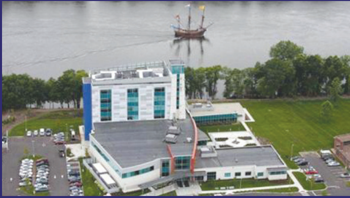
Goodwin College River Front Campus – before and after

“The Goodwin College Riverfront Campus exemplifies the extraordinary potential of public-private partnerships directed at sustainable development, smart growth, and brownfields revitalization. Until four years ago, the site of our campus was a forgotten industrial wasteland – acres of rusted oil tanks, and soil permeated with petroleum and industrial contaminants. Today, through the support of our partners, we cleaned up the land, making way for a world-class learning center serving 3,000 students and the broader community, and opening access to one of the region’s greatest natural resources.”