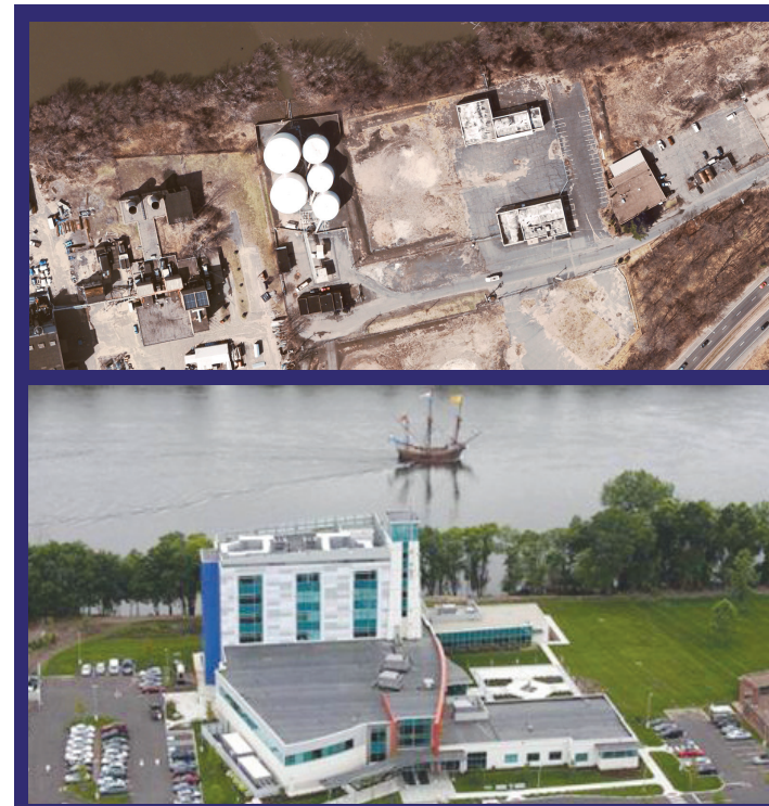
Goodwin College River Front Campus – before and after

The environmental site assessments revealed contaminants, such as petroleum, lead, volatile organic compounds (VOCs), and polycyclic aromatic hydrocarbons (PAHs). Cleanup involved removing the above-ground petroleum storage tanks and using natural bioremediation techniques to clean up contaminated soils to residential standards. Completed in 2012, this successful remediation and redevelopment is the result of an effective partnership among the Town of East Hartford, Goodwin College, Capitol Region Council of Governments, MetroHartford Alliance, Connecticut Development Authority, and DEEP.