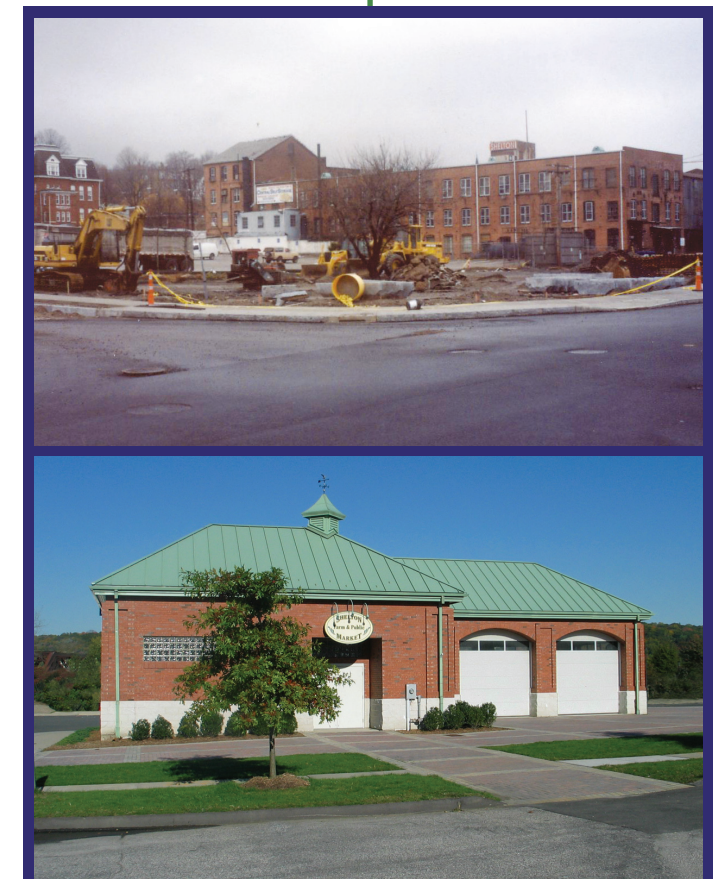
Shelton Farmers Market – before and after

The final cleanup remedy involved removing more than 1,200 tons of contaminated soil from the property and replacing it with clean fill and a permanent cap in accordance with DEEP regulations. With its new building and outdoor merchant space, the Shelton Farmers Market is an ideal place for local farms to sell their produce.