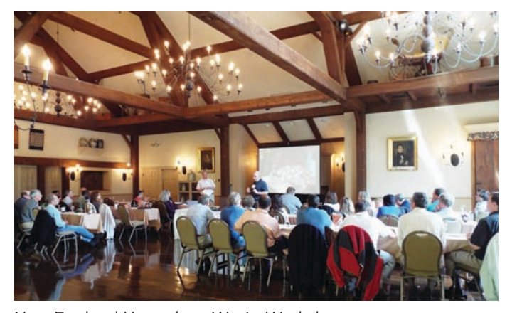
New England Hazardous Waste Workshop

2015 NEWMOA Hazardous Waste Program Area Chair