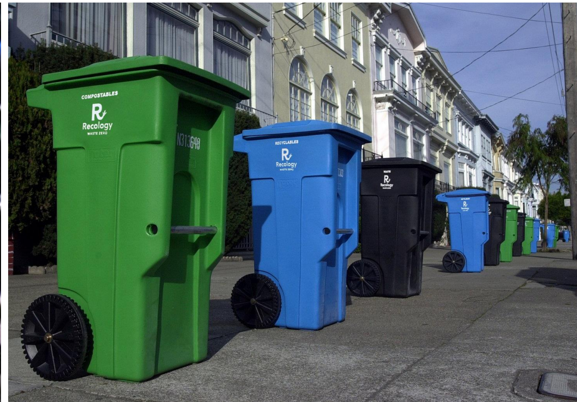
San Francisco, CA