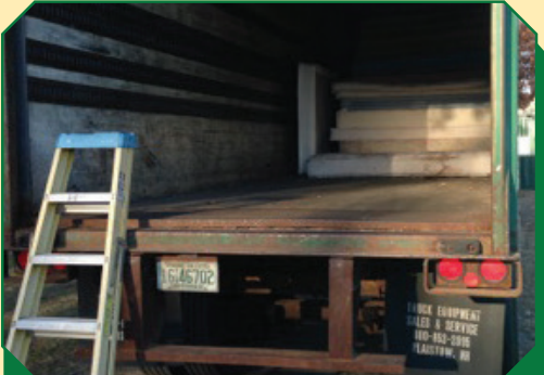
Inside of a Mattress Collection Trailer

Extended produce responsibility (EPR) is a mandatory program that includes, at a minimum, the requirement that the producer’s responsibility for its product extends to post-consumer management of that product and its packaging. In 2016, three states have passed EPR laws for mattresses and implemented programs: California, Connecticut, and Rhode Island. In all three programs, consumers pay a fee at the point of purchase for any new mattress or box spring to finance the end-of-life recycling/disposal costs. The program works with municipal waste collection programs (curbside and transfer station drop-off) and retailers that take-back used mattresses to provide a system that collects, transports, and recycles mattresses. The program must be convenient for residents, and they cannot be charged a fee for using the service. Mattress manufacturers established the Mattress Recycling Council (MRC) to implement the programs.