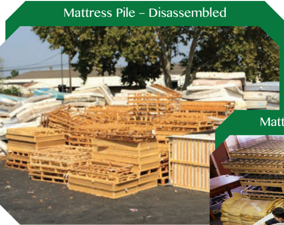
Mattress Pile – Disassembled

Since the processing of mattresses for recycling involves the dismantling and removal of recyclable components, it is less likely that bed bugs would survive and pose a problem within the new product or material.