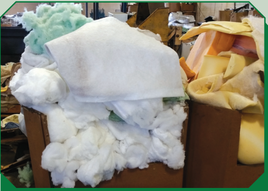
Preparing to Bale

For more information, visit: www.rawmatrec.com .