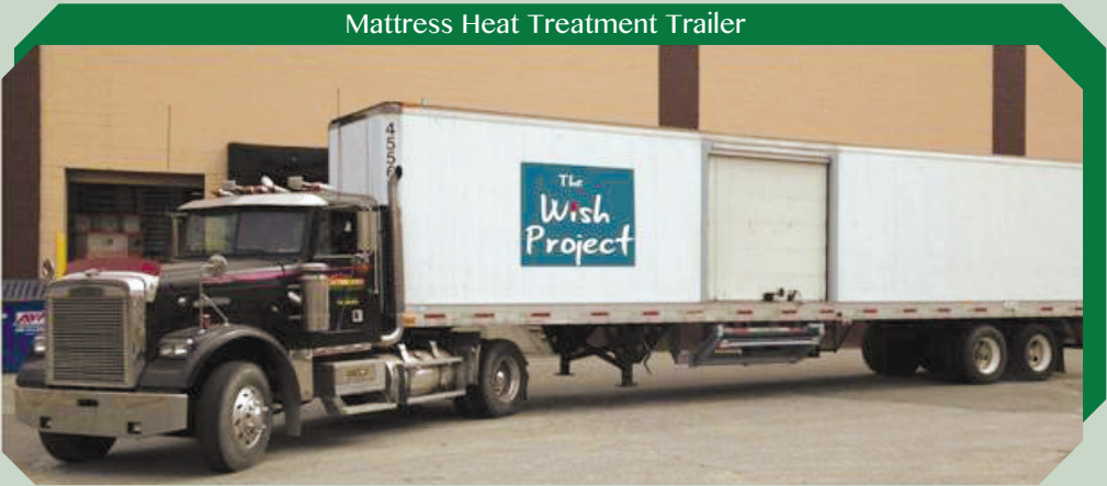
Mattress Heat Treatment Trailer

For more information, visit: www.thewishproject.org . A list of more than 80 additional furniture banks across the U.S. and Canada is available at www.furniturebanks.org/list-of-furniture-banks/ .