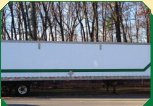
Example of Mattress Trailer

For more information, visit: www.mass.gov/eea/agencies/massdep/recycle/reduce/mattress-recycling.html .