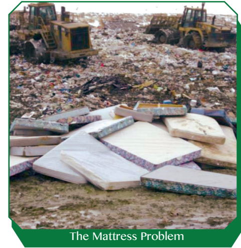
The Mattress Problem

Old mattresses are difficult to handle and transport, and they can consume increasingly scarce landfill space. Disposing of mattresses is challenging for homeowners and expensive for local waste authorities, particularly in rural communities. Some of the mattresses that are thrown away might be reusable or contain materials that, through recycling, can replace virgin material in the manufacturing of new products reducing their carbon footprint and overall environmental impact.