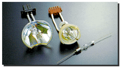
Mercury Short-Arc Metal Halide Lamp

relatively larger amounts of mercury, typically between 100 mg and 1,000 mg. Nearly a quarter of these lamps contain more than 1,000 mg of mercury.