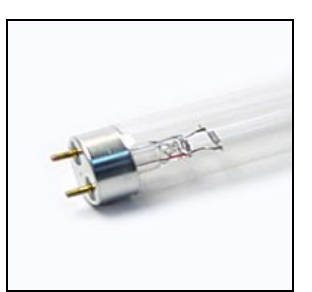
Germicidal Lamp; Photo Source: Northeast Lamp Recycling, Inc.

Germicidal lamps do not use phosphor powder and their tubes are made of fused quartz that is transparent to short-wave UV light. The ultraviolet light emitted kills germs and ionizes oxygen to ozone. These lamps are often used for sterilization of air or water.