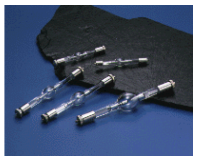
Mercury Xenon Short-Arc Lamps; Photo Source: Northeast Lamp Recycling, Inc.

Mercury xenon short-arc lamps operate similarly to mercury short-arc lamps, except that they contain a mixture of xenon and mercury vapor. They require a shorter warm-up period compared with regular mercury short-arc lamps, and they have better color rendering. They are used mainly in industrial applications. The mercury xenon short-arc lamps can contain anywhere between 50 mg and 1,000 mg of mercury. A small percentage of these lamps contain more than 1,000 mg of mercury.