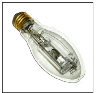
Metal Halide Lamp

the power level. According to NEMA, about one-third of these lamps sold in the U.S. contain greater than 100 to 1,000 mg of mercury.