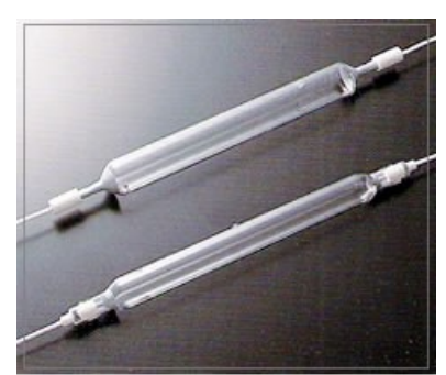
Mercury Capillary Lamps; Photo Source: Northeast Lamp Recycling, Inc.

Mercury capillary lamps provide an intense source of radiant energy from the ultraviolet through the near infrared range. These lamps require no warming-up period for starting or restarting and reach near full brightness within seconds. They come in a variety of arc lengths, radiant power, and mounting methods, and are used in industrial settings (i.e., for printed circuit boards), for UV curing, and for graphic arts. UV curing is widely used in silkscreening, CD/DVD printing and replication, medical manufacturing, bottle/cup decorating, and converting/coating applications. These specialized lamps contain 100 to 1,000 mg of mercury.