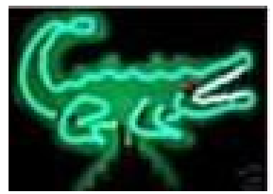
Neon Alligator Signage

Although the term "neon light" refers to all gas discharge bulbs using noble gases, regardless of the lamp color, only the red bulbs are true neon lights (i.e., use neon). Red neon lamps do not contain mercury. Almost every other "neon light" color uses argon, mercury, and phosphor, in addition to other noble gases.