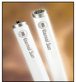
Tanning Lamps; Photo Source: Northeast Lamp Recycling, Inc.

Tanning lamps use a phosphor composition that emits primarily UV-light, type A (non-visible light that can cause damage to the skin), with a small amount of UV-light, type B.