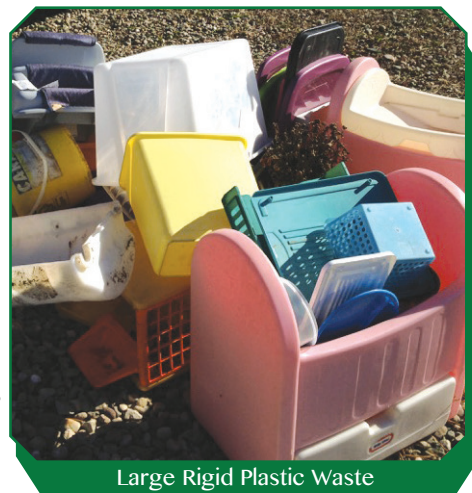
Large Rigid Plastic Waste

Large rigid plastic items are generally defined as being the size of a five gallon bucket and larger, and are therefore, too big to include in the regular recycling stream. They include outdoor furniture, kiddie toys, pools, play structures, laundry baskets, and recycling bins. These products present significant opportunities for reuse and recycling.