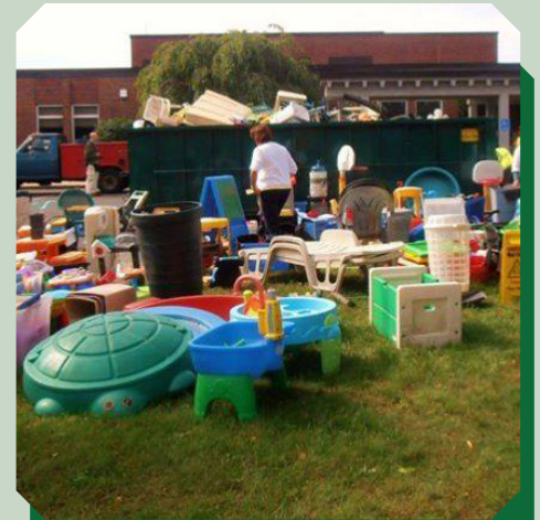
Northampton Recycling and Swap

For more about the Northampton ReUse Committee, visit: www.facebook.com/NorthamptonReUse .