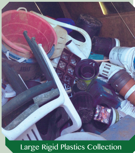
Large Rigid Plastics Collection

The town of Whately, MA is located in rural Franklin County in the western area of the State and has a population of about 1,500. In 2015, town officials found out that the local MRF would accept bulky rigid plastics for processing, and they decided to take advantage of this opportunity. The town uses a 40-cubic yard recycling roll-off at the transfer station to collect the materials, and they offer free drop-off for residents of Whately and surrounding communities. In the first year, they shipped two full containers to the MRF. Hauling this material to the MRF costs the same as transporting it to the landfill, and the town received approximately $10 in revenue for each load from the MRF instead of having to pay the landfill for disposal.