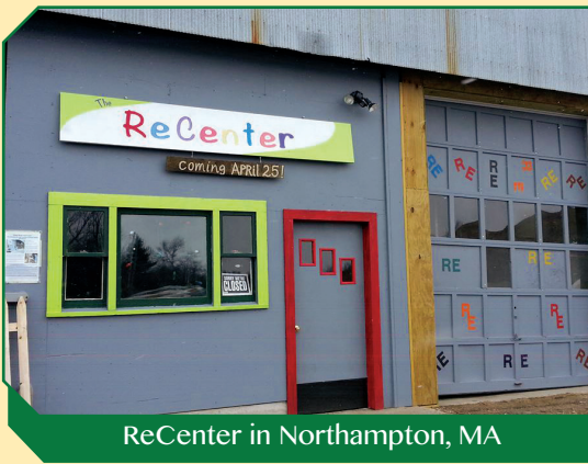
ReCenter in Northampton, MA

An alternative to a permanent “swap shop” could be a special community event where furniture is collected for donation to a partner charity or is operated as a one-day drop-and-swap exchange. If there are remaining items left onsite after the event, communities could contract with a private hauling company. These haulers can pick up all types of furniture for a fee, and many of them will recycle what they are able to (typically metal). Ultimately some of the material may end up in the landfill or incinerator.