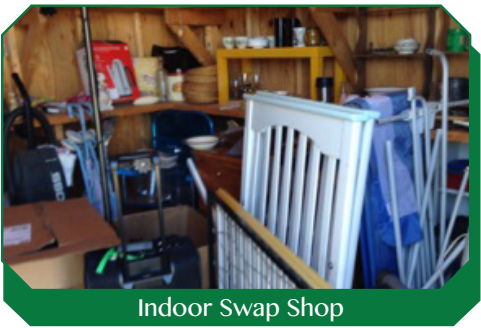
Indoor Swap Shop

To promote diversion of usable materials from disposal, some communities operate a “swap shop” at their transfer station or recycling center where residents drop-off and/or pick-up all manner of items in reusable condition. This can consist of a permanent or seasonal building, barn, shed, tent, or covered open outdoor area. However, to accept furniture, the community would need to ensure that the storage place is covered so that items can stay dry and big enough to store large items. Generally, swap shops work best when the drop-off can be monitored so that residents cannot leave items that are in poor condition.