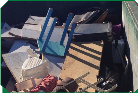
Example of Bulky Bin