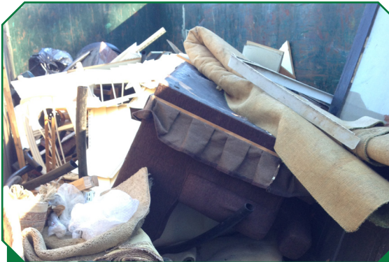
Example of Bulky Bin

Many communities maintain a bulky waste collection bin at their transfer station or recycling center where residents can dispose of large pieces of furniture for a fee. Once these boxes are full, they are typically sent to a disposal facility. To facilitate recycling of at least some of the discarded materials, communities should contact a C&D processing facility and assess the feasibility of sending their bulky wastes to them instead of disposal. Another alternative to increase recycling could be to host a one-day event specifically for collecting and sorting furniture suitable for recycling.