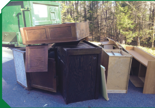
Segregated furniture at a transfer station

Furniture generally includes large household items made from metal, plastic (e.g., patio or garden furniture), and/or wood. Some furniture is upholstered. This document focuses on wood and upholstered furniture, including couches, chairs, tables, bureaus, desks, and bedframes because this material presents significant opportunities for reuse and recycling. Metal recyclers value the steel, aluminum, and other materials in metal furniture, making them easily diverted from landfill disposal. Most municipal programs currently recycle these metal products. Guidance on reuse and recycling of plastic furniture is covered in a separate document that focuses on “Large Rigid Plastics Items”.