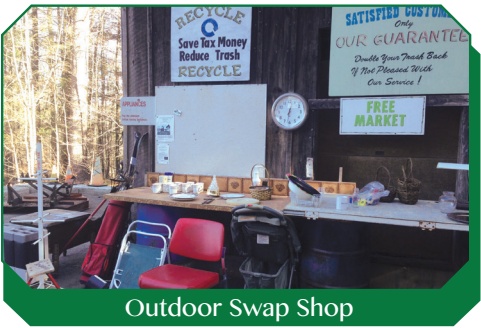
Outdoor Swap Shop

An alternative to a permanent “swap shop” could be a special community event where furniture is collected for donation to a partner charity or is operated as a one-day drop-and-swap exchange. If there are remaining items left onsite after the event, communities could contract with a private hauling company. These haulers can pick up all types of furniture for a fee, and many of them will recycle what they are able to (typically metal). Ultimately some of the material may end up in the landfill or incinerator.