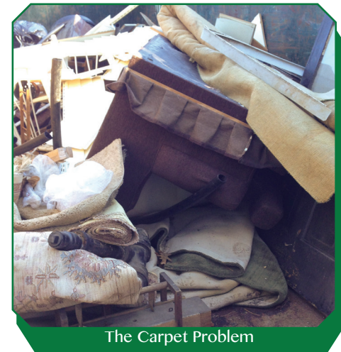
The Carpet Problem

Unwanted carpet is difficult to handle and transport and consumes increasingly scarce landfill space. Disposing of carpet is challenging for homeowners and expensive for local waste authorities, particularly in rural communities. Some of what is thrown away might be reusable or contain materials that, through recycling, can replace virgin material in the manufacturing of new products reducing their carbon footprint and overall environmental impact.