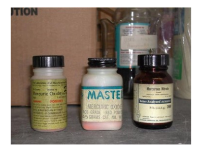
Mercury Compounds

Mercury content for preservatives and reagents and mercury compounds typically ranges from greater than 0 to greater than 250 ppm, with some chemical products containing a mercury concentration of greater than 100,000 ppm.