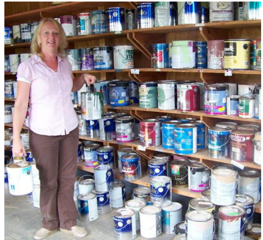
The Latex Paint Exchange Fulton County, NY