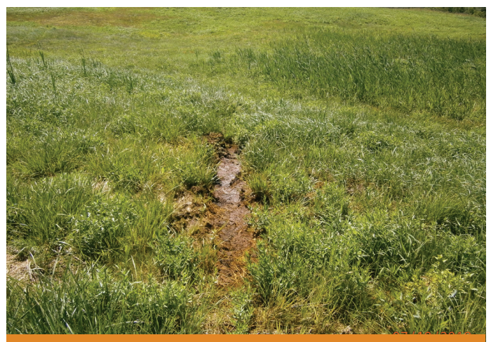
Leachate Seep on Landfill Side Slope