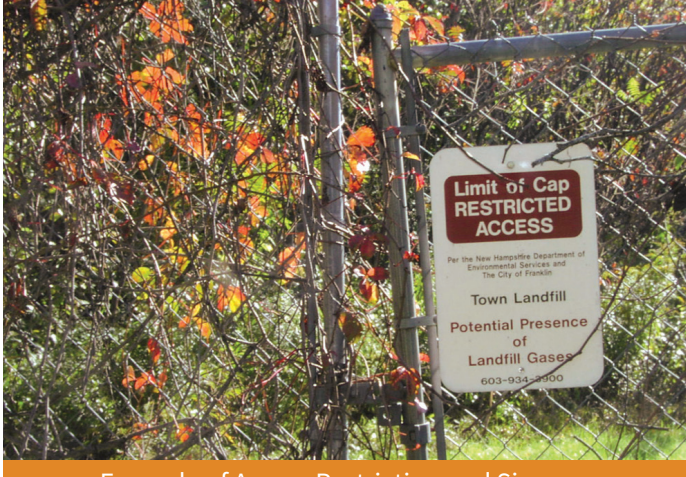
Example of Access Restriction and Signage