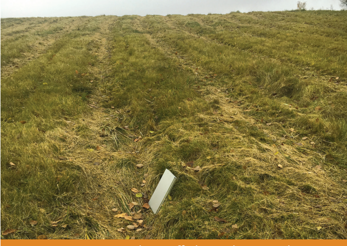
Deep Ruts and Runoff-channels Created by Mowing Tractor