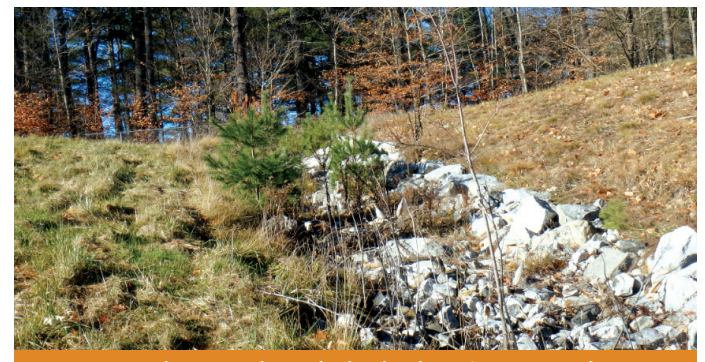
Woody Growth and Blocked Drainage Swale

Landfills without engineered features have runoff channels that develop over time. If possible, runoff should be diverted into engineered features. If that is not possible, the naturally formed runoff channels should be protected to prevent scouring by ensuring good grass cover growth and/or adding gravel or riprap.