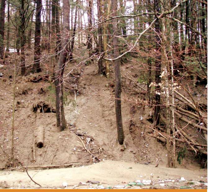
Old Landfill with Tree Growth and Erosion (note exposed waste in channels and at base)

Municipal officials should ensure closed landfills are regularly inspected and maintained. Properly maintained cover soil and vegetation systems are effective at reducing the risk of water resource contamination. Recommended practices are outlined below.