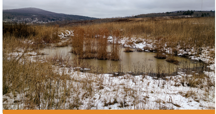
Ponding On a Landfill Due to Settlement