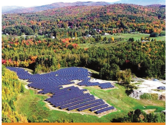
Solar Panels on a Closed Landfill