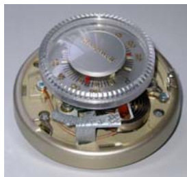
Mercury Switch inside Thermostat