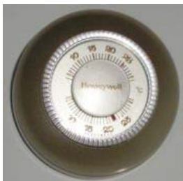
Mercury Thermostat

Mercury thermostats contain bimetal coils that contract and expand with room temperature. When the coil contracts or expands, it activates the mercury switch, which opens or closes a circuit to make the furnace, heat pump, or air conditioner turn on or off. A mercury thermostat may contain one or more switches, depending on how many heating and cooling systems it activates.