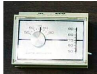
Mercury Thermostat

According to the Thermostat Recycling Corporation (TRC), mercury thermostats contain an average of 1.4 mercury switches (i.e., components), with a minimum of 2.8 grams of elemental mercury per switch. Therefore, the total amount of mercury used in a single thermostat is more than four grams. Industrial-sized thermostats may have multiple switches and thus have reported higher amounts of mercury. Some examples of industrial thermostats reported by manufacturers include a low-voltage multi-stage wall thermostat and a heat pump thermostat.