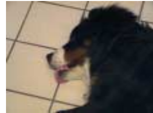
Deacon (floor cleaner)