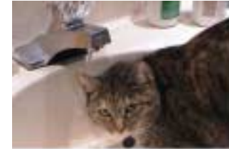
Zaboo (washroom & fixture cleaner)